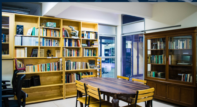
Archives at NCBS Reading Room